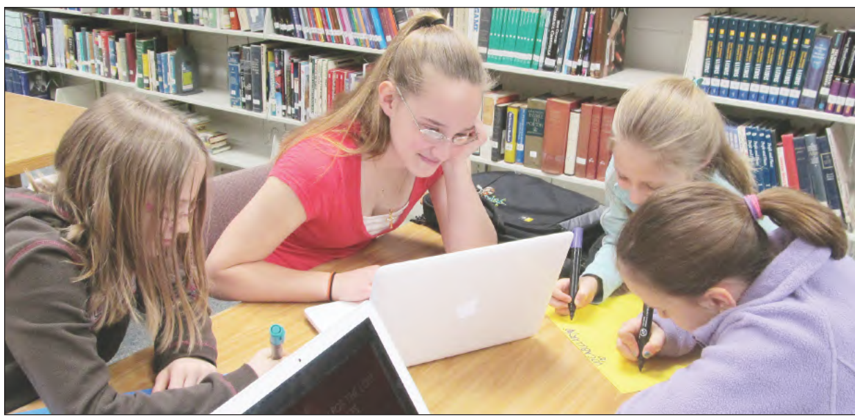
Courtney Ofstad/Daily Globe

Answer: It occurred in September of 1900, in Galveston, Texas and killed over 8,000 people.